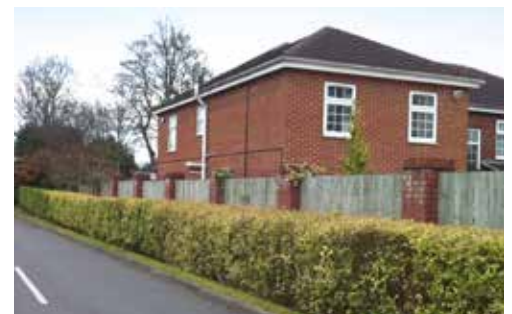
Two bespoke four bedroom family homes